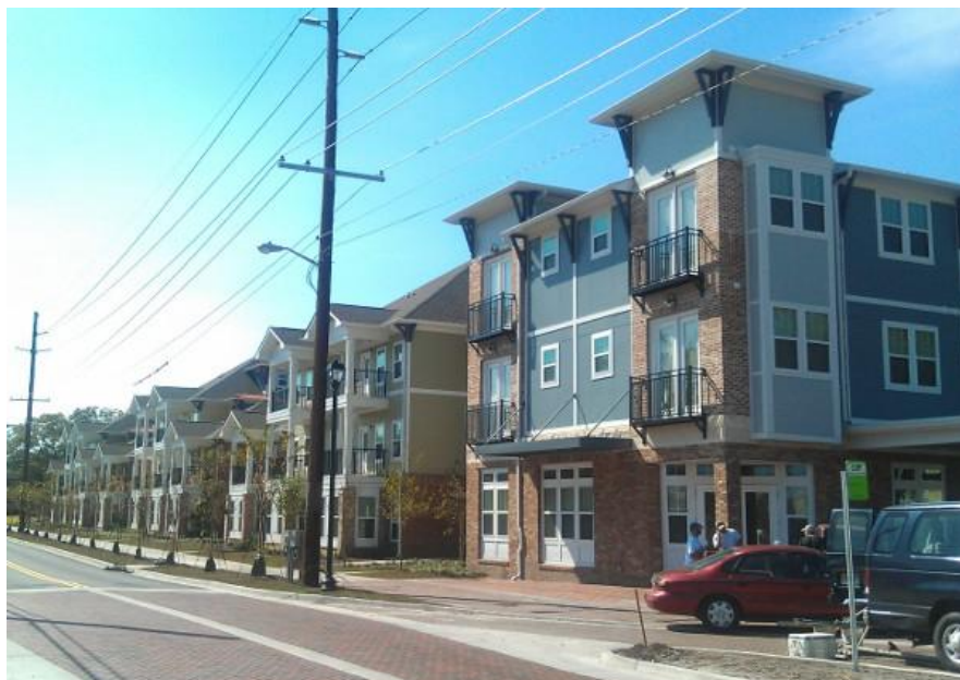
View looking down the newly rebuilt Pennsylvania Ave

The 14 buildings that make up Phase I adhere to the architect's Traditional Neighborhood Design (TND) concept as well as creates a much more pleasing pedestrian experience down Pennsylvania Ave.