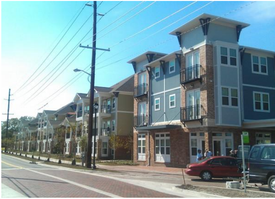
View looking down the newly rebuilt Pennsylvania Ave

LDG Consulting was engaged to ensure the developer's and owner's interests were protected during construction. Among other activities, we conducted site visits, produced owner reports, reviewed proposed change orders, and participated in payment application meetings.