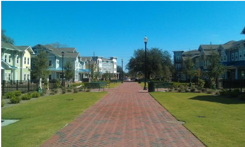
View looking down Promenade Park

The first of several phases, Phase I has made a dramatic impact on the site formerly known as Strathmore Estates located east of Downtown Savannah.